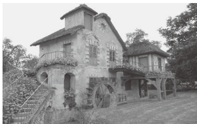
one of Marie Antoinettes's 'simple' cottages at Versailles 18

Wabi-cha combines a simple kind of room and atmosphere, with a moderate display of meibutsu, a style Sôji explains with a quotation from part of a poem that means something like ‘a valued horse tied to a simple hut’ 17 . One should also realize that what is seen as just a simple tea-room was a room built for the sole purpose of performing the tea ceremony, something that could only be afforded by the very rich. It calls to mind the ‘simple’ countryside cottages that Marie Antoinette had built for her entertainment next to the Palace of Versailles.